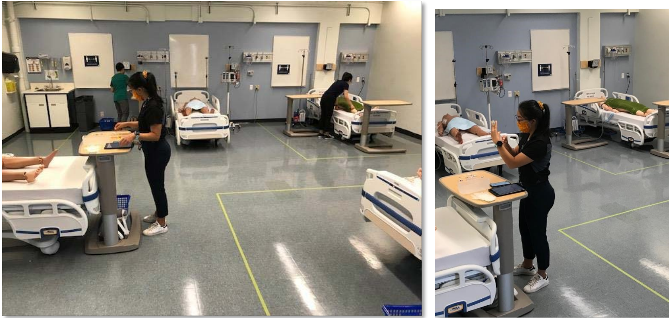
Skills Lab SE12 416A, adhering to social distancing guidelines and wearing non-medical grade masks.