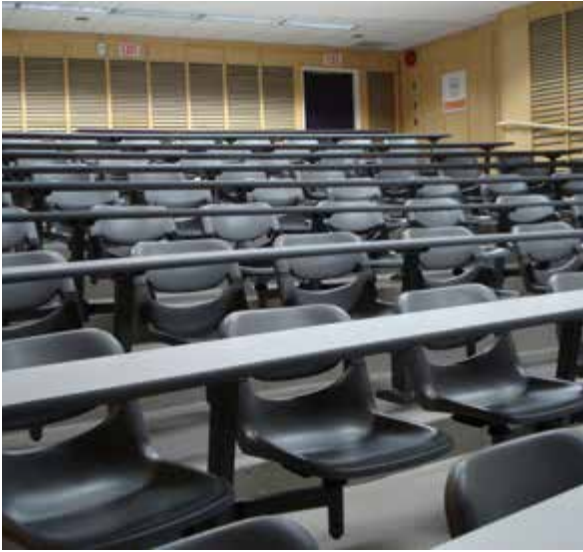
Typical Lecture Theatre