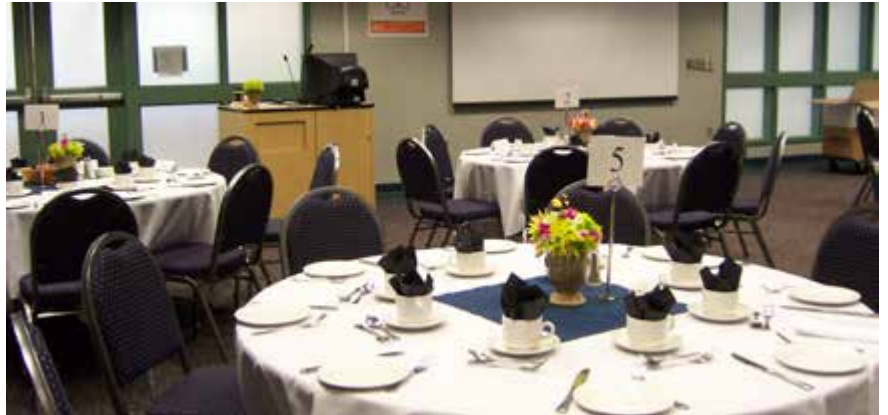
Town Square A&B