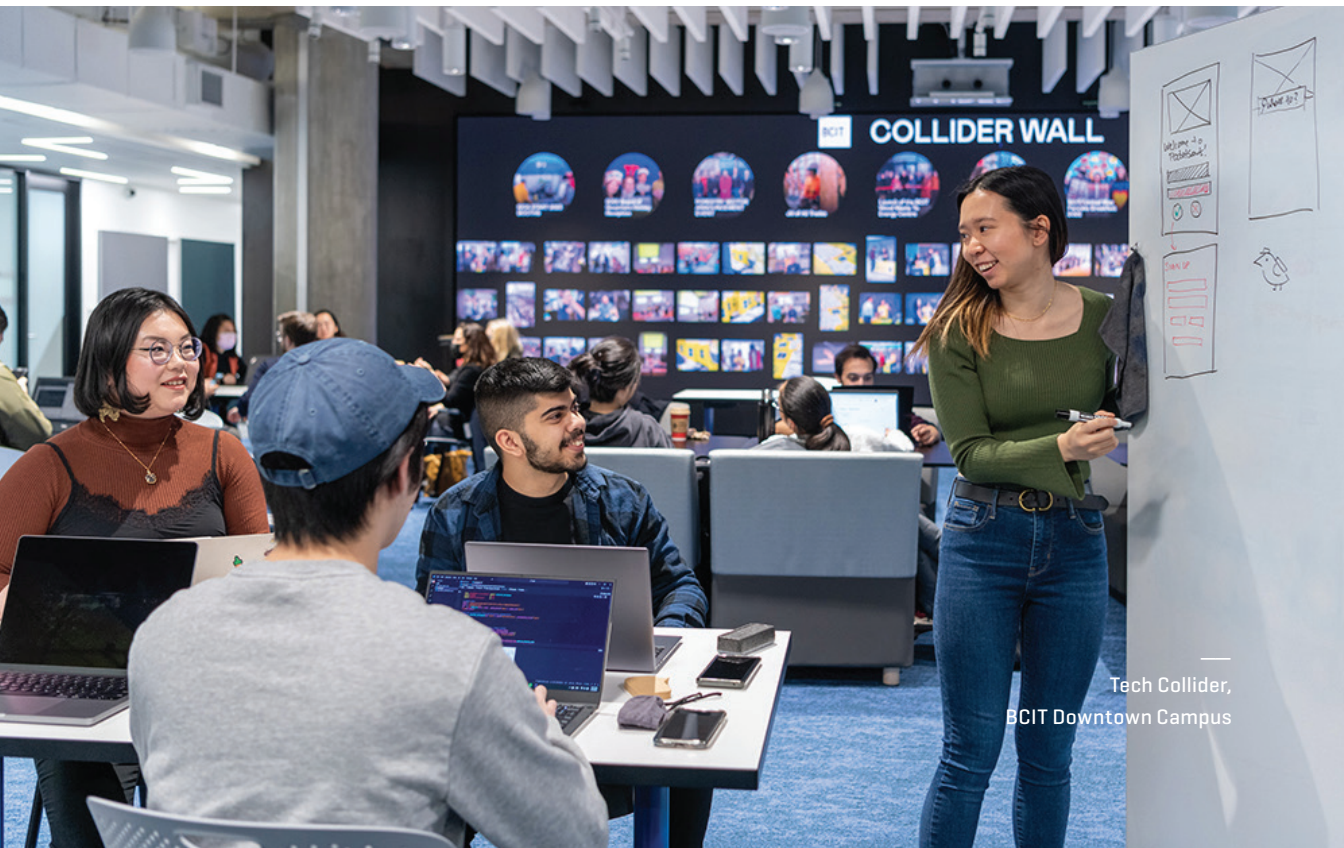
Tech Collider, BCIT Downtown Campus

Visit bcit.ca/studyabroad to learn more.