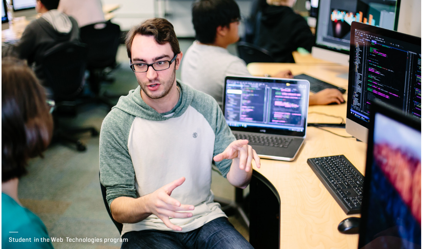
Student in the Web Technologies program