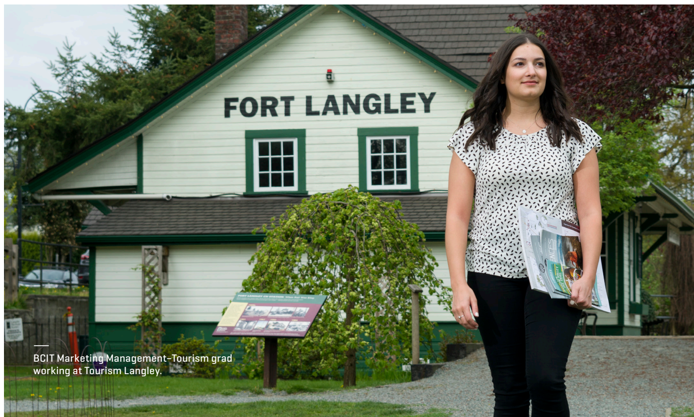
BCIT Marketing Management–Tourism grad working at Tourism Langley.