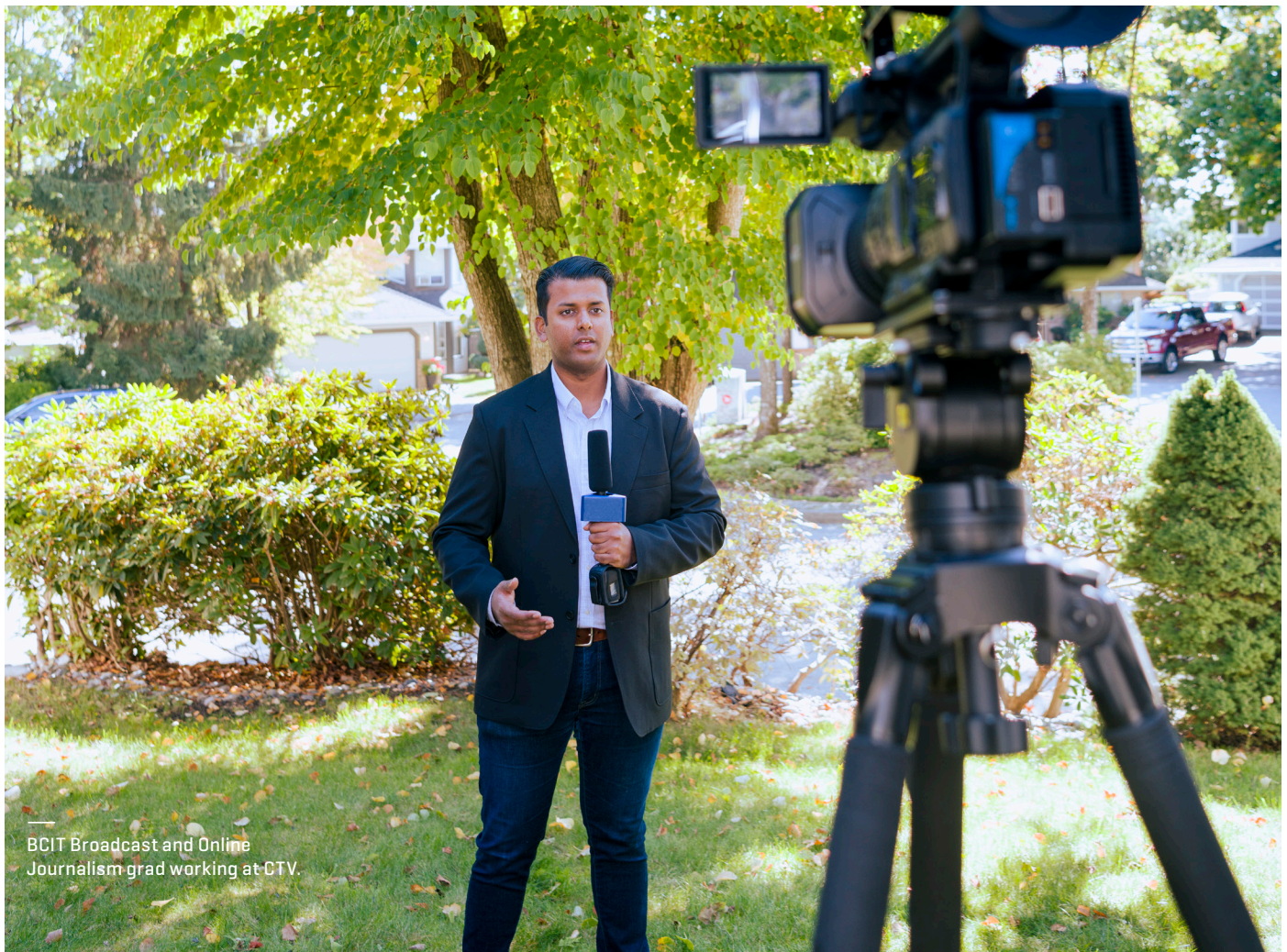
BCIT Broadcast and Online Journalism grad working at CTV.