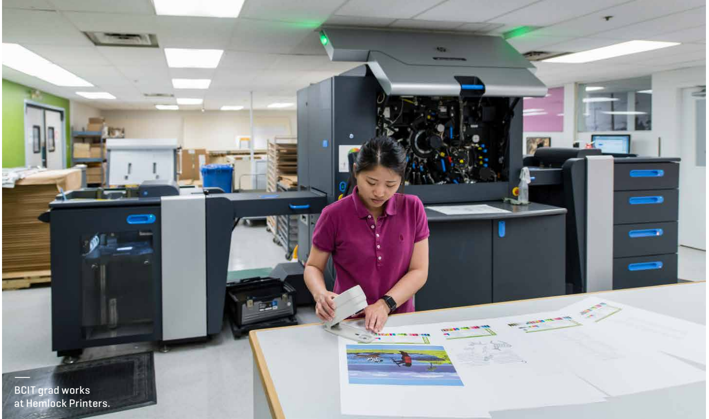
BCIT grad works at Hemlock Printers.