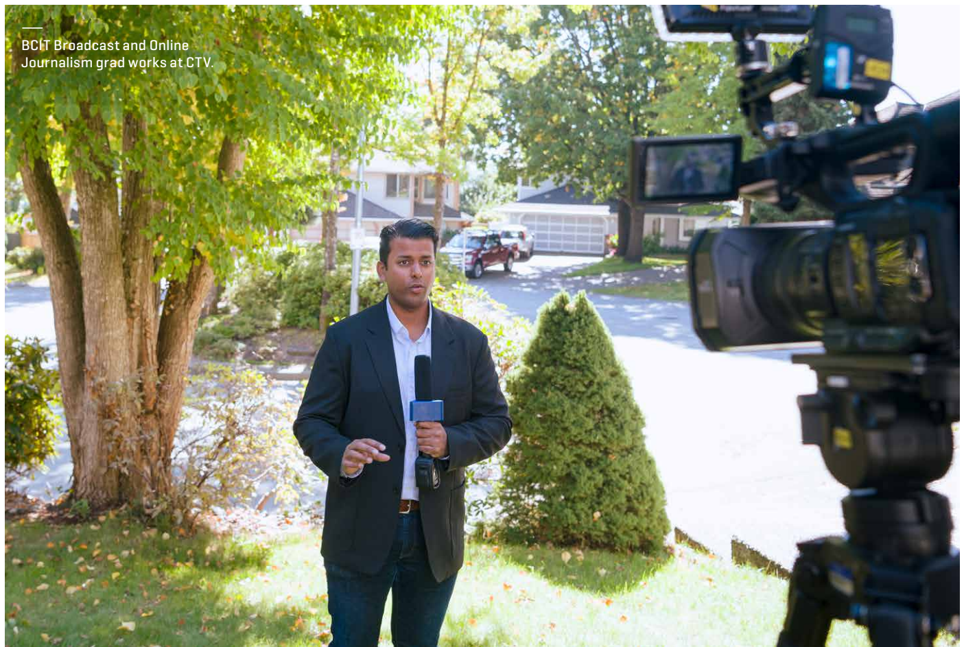
BCIT Broadcast and Online Journalism grad works at CTV.