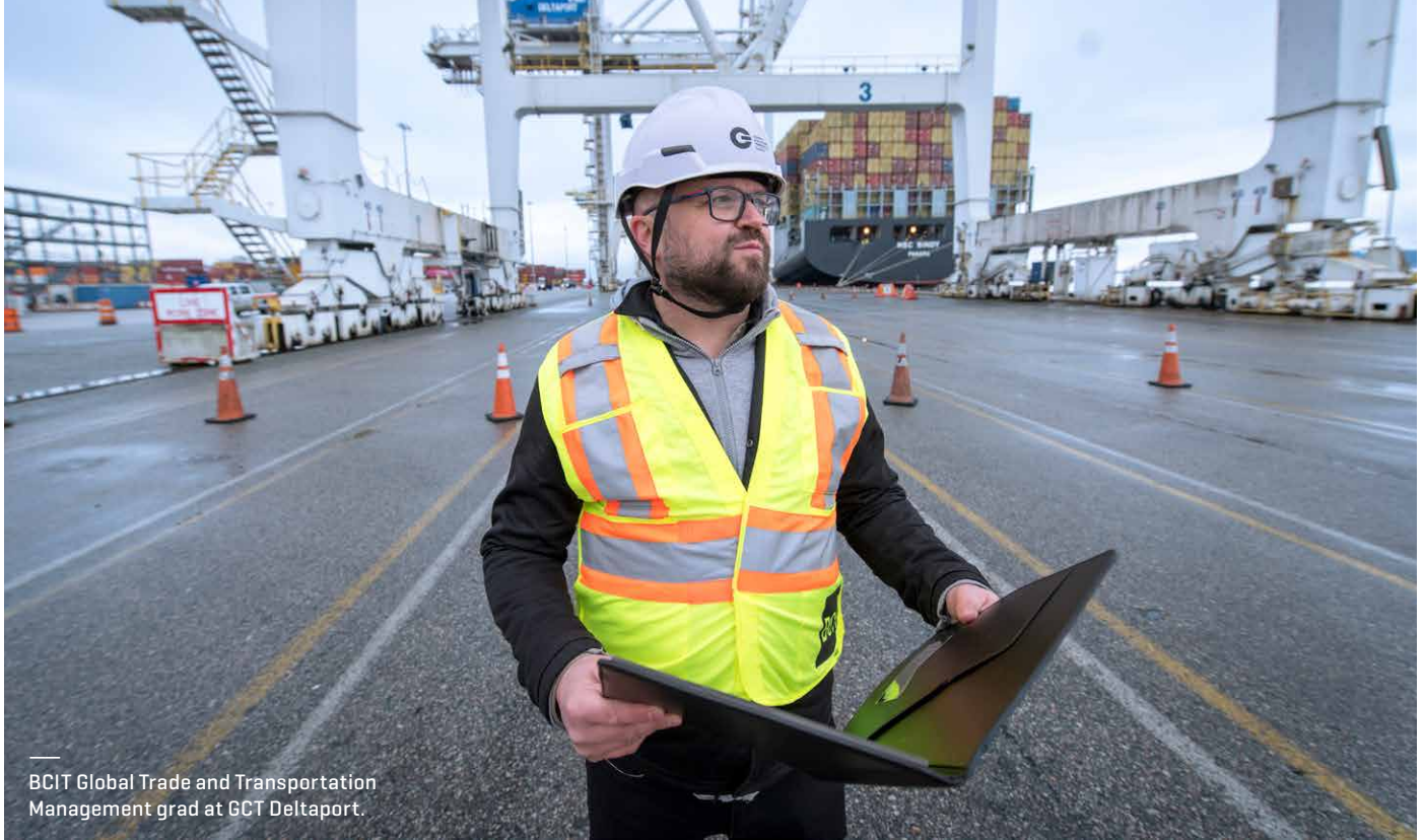
BCIT Global Trade and Transportation Management grad at GCT Deltaport.