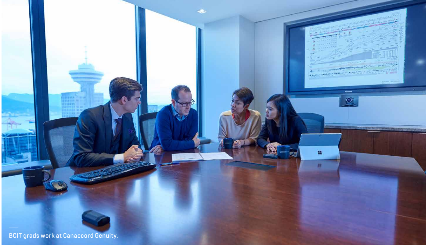
BCIT grads work at Canaccord Genuity.