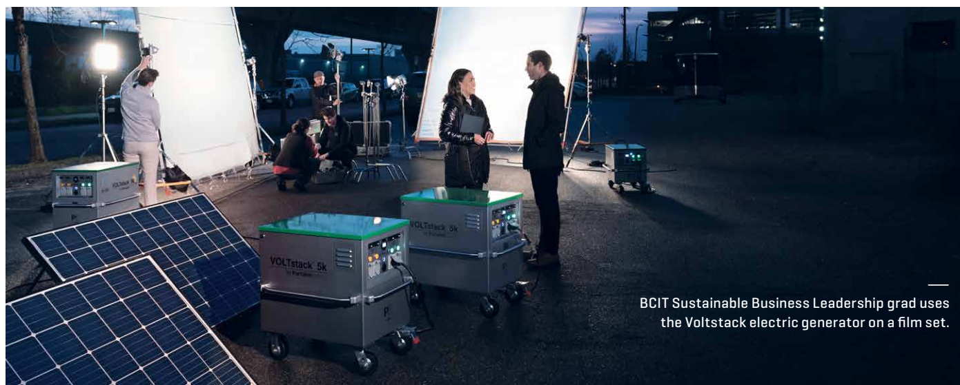
BCIT Sustainable Business Leadership grad uses the Voltstack electric generator on a film set.