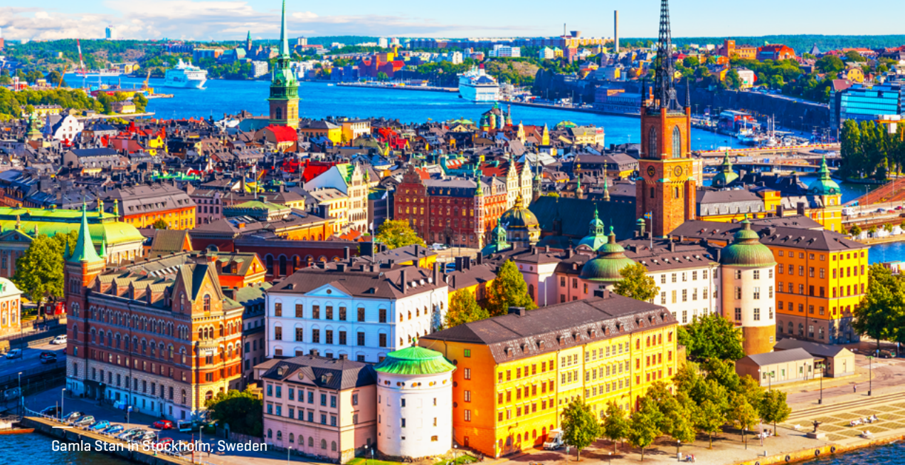
Gamla Stan in Stockholm, Sweden