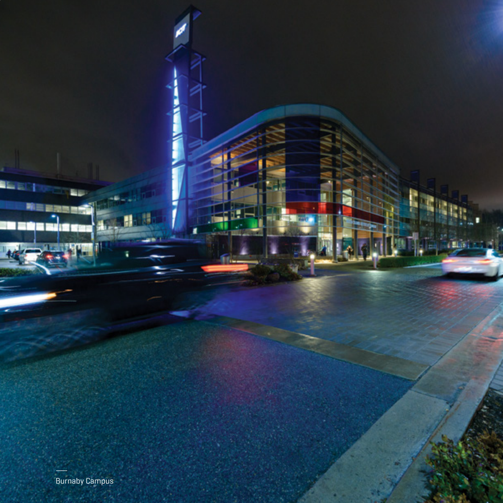
— Burnaby Campus