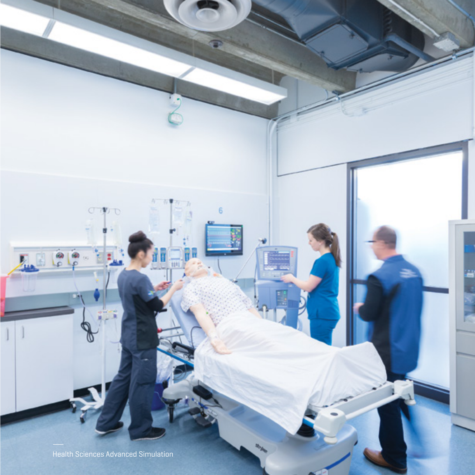
Health Sciences Advanced Simulation